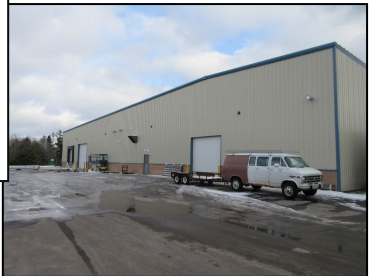
Advanced Blending Solutions finished building