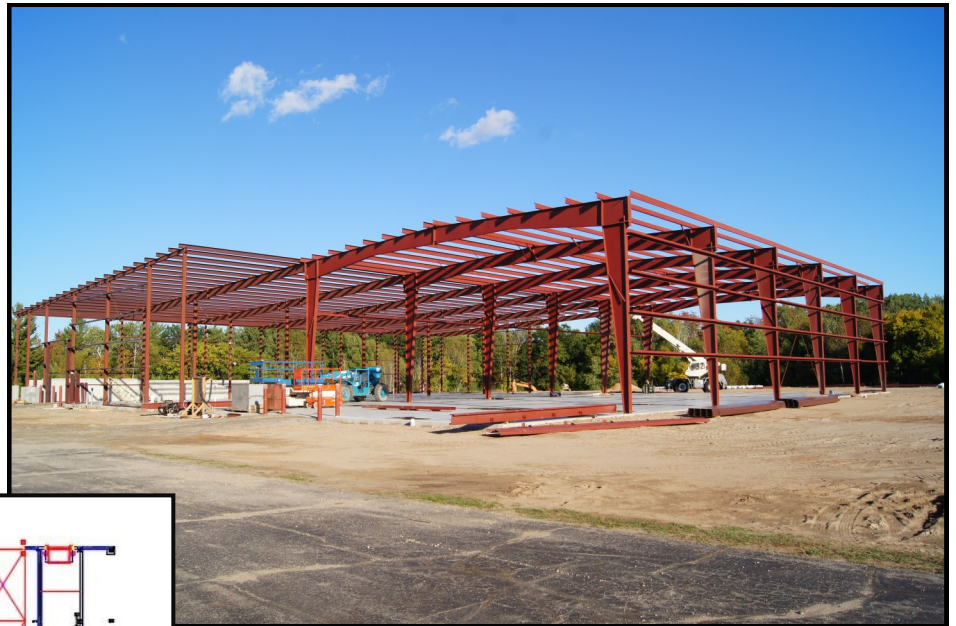
Advanced Blending Solutions steel frame

The project included complete building design services, including architectural, civil, structural, mechanical, electrical and plumbing design.