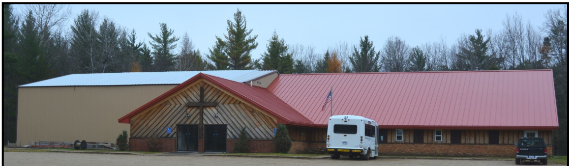
After new roof.