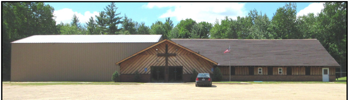
Before new roof.

The hand built trusses in the original church had structural failure throughout the roofing system, and started its collapse during a worship service. We designed a new roof structure with engineered trusses and corrected the connecting roof lines.