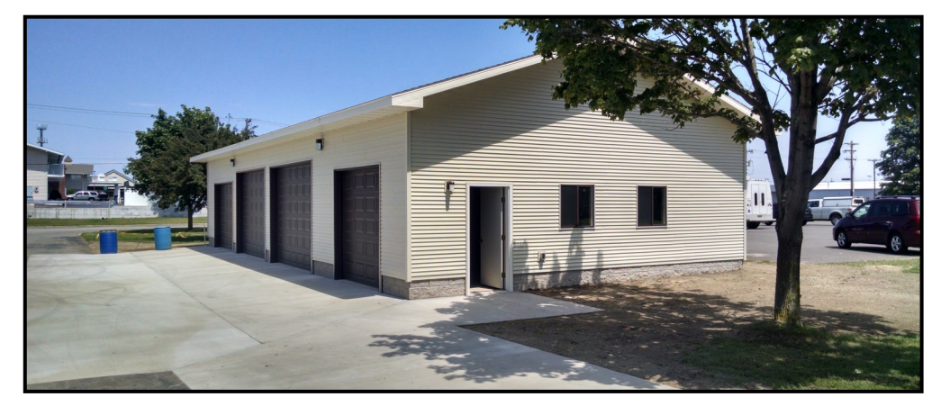
New Maintenance Garage - Southwest corner

The project included complete building design services, including structural, architectural, civil, mechanical and electrical.