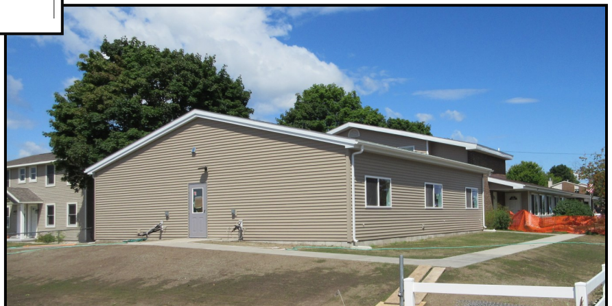
Bridgewood Adult Group Home with the new addition