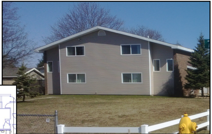
Bridgewood Adult Group Home before new addition.