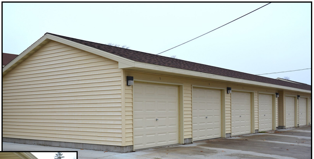
Parking Garage alley view.

This is a 17 bay tenant parking garage is located in downtown Escanaba and situated on an alley way. Maximum parking capacity in the limited space were challenges in this design. The garage features 16 tenant parking stalls, a maintenance parking stall with a service door and an enclosed area for garbage containers.