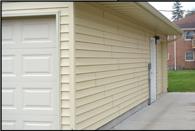
Parking Garage service door.