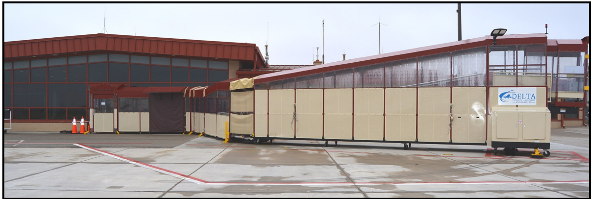
New Boarding Bridge / Ramp

DDGi worked closely with the owner and the owner's airport engineering consultant to complete this project.