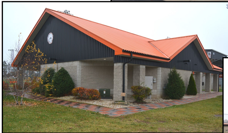
Eskymos Concessions Building - North West side