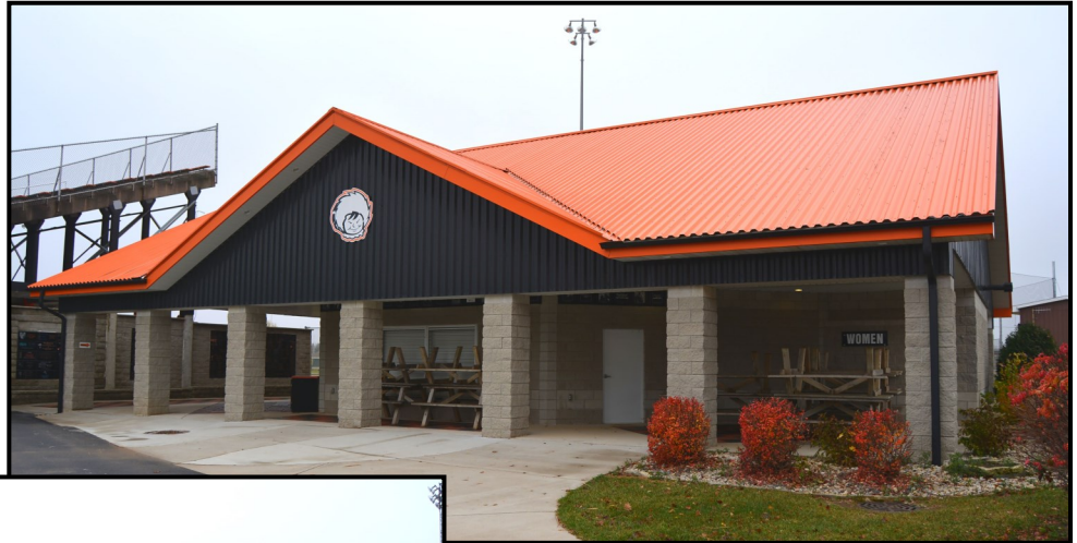
Eskymos Concessions Building - East side

The Escanaba Eskymo concessions building includes a large area for the preparation and sale of concessions, lots of covered roof area, storage rooms and large, inviting accessible restrooms. The plan also included separate admission gates which welcome fans into the complex.