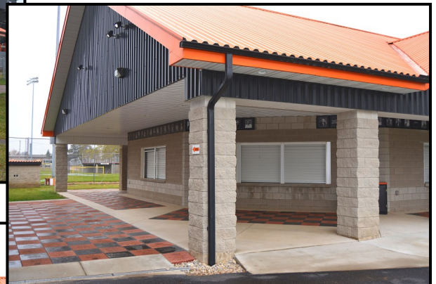
Eskymos Concessions Building - South East Side