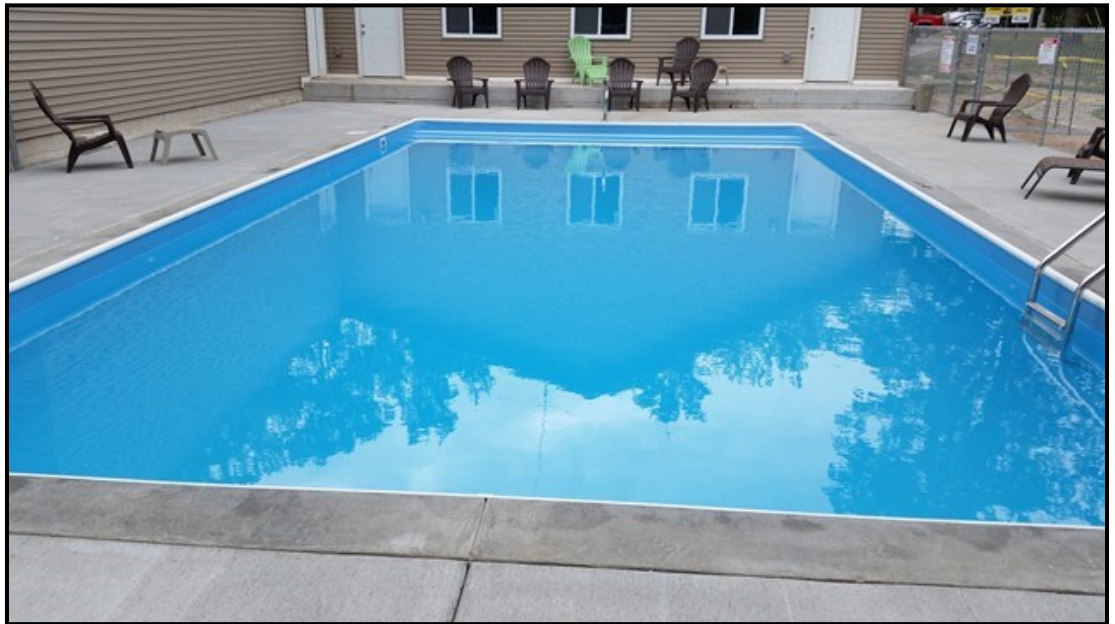
The new KOA swimming pool.

The KOA Campground needed to replace the outdated swimming pool with a new swimming pool and mechanical system. We designed the new pool to meet current Michigan public swimming pool codes while helping the client and builder decipher the codes to ensure a smooth construction process.