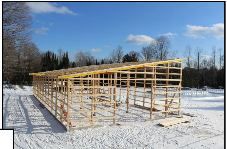
Miller Family Farm Aquaponic Building in progress

The project included complete building design service including architectural, civil, structural, mechanical, electrical and plumbing.