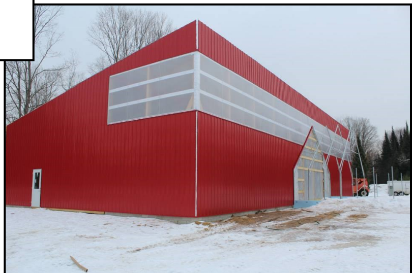
Miller Family Farm Aquaponic Building nearing completion