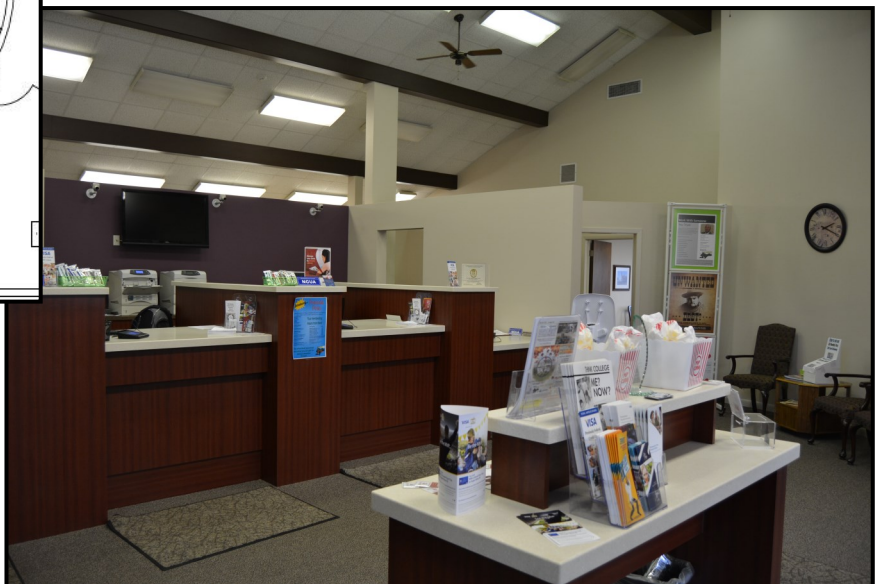
Lobby after remodel