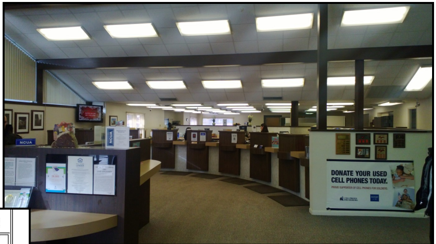
Lobby prior to remodel

The Peninsula Federal Credit Union branch on County Road 426 was in need of more working space as well as an updated, fresh new look. This remodel focused on the functionality of the space while keeping it simple and clean. By pushing the reduced number of teller windows out farther into the lobby, we were able to give the employees more work space and the customers they serve easy access to the larger modern teller windows.