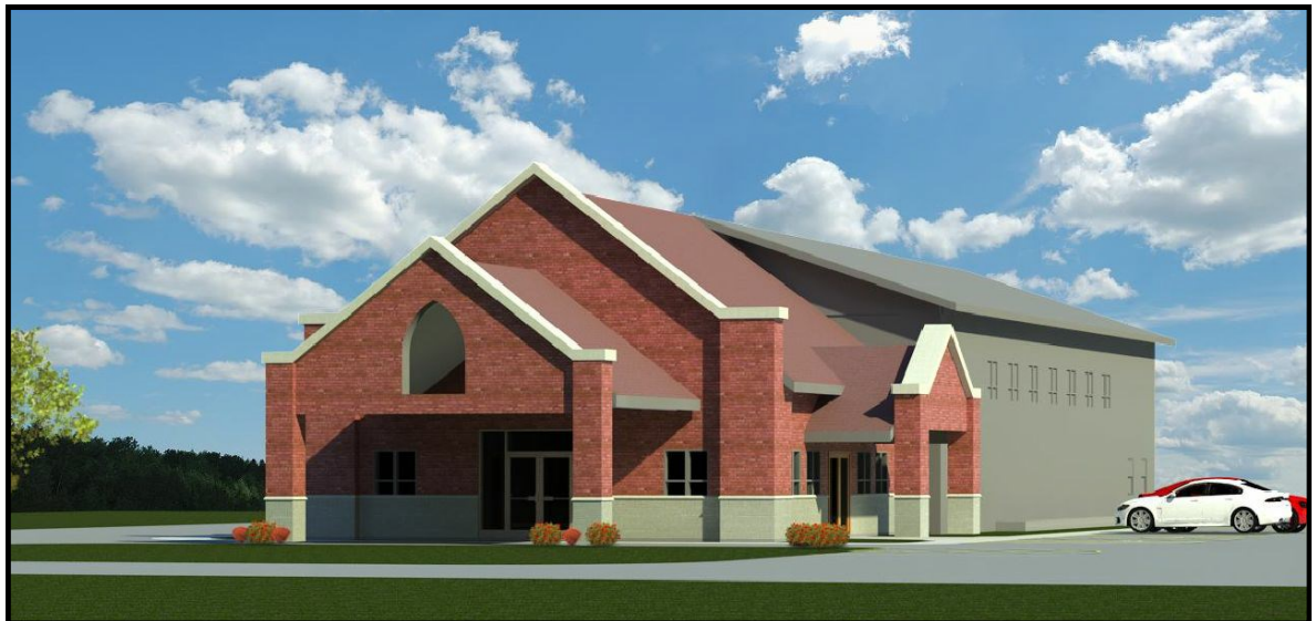
West view of the proposed addition - 3D Rendering

Currently, the Parish is pursuing a capital campaign and the project is scheduled for 2016. To assist with their fund raising efforts, presentation boards were prepared for displaying in their existing church facility. This includes conceptual floor plans, site plan, elevations and colored 3D renderings.