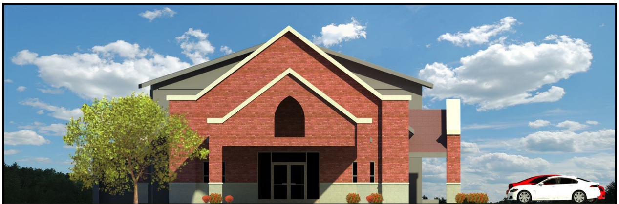
West view of the proposed addition - 3D Rendering