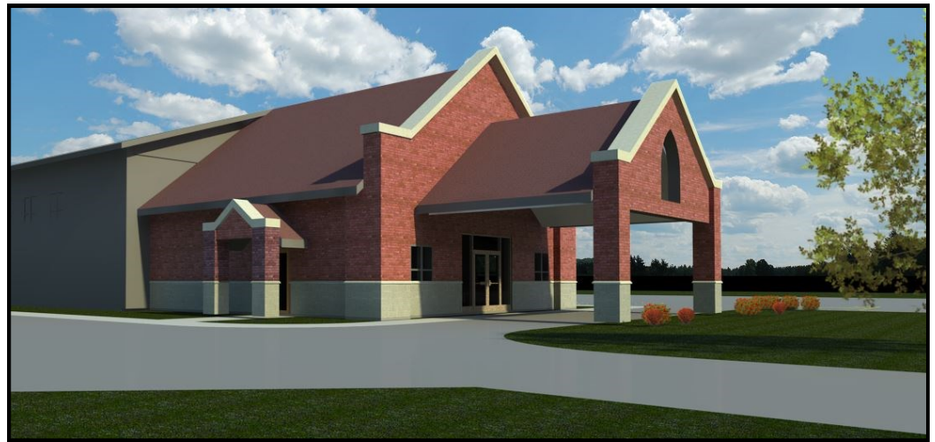
North West view of the proposed addition - 3D Rendering